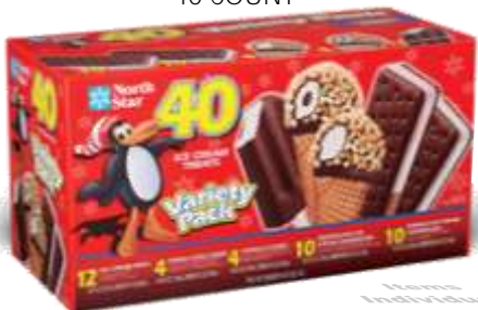
12-Ice Cream Bars 10-Neapolitan & 10-Vanilla Sandwiches 4-Fudge & 4-Vanilla Sundae Cones