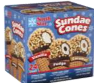
8-Vanilla Sundae Cones 8-Fudge Sundae Cones 8-Carmel Sundae Cones