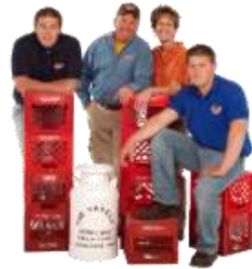
The Vorels Prairie Farms Dairy Family

Farmer-owned for over 70 years and over 700 farms strong, Prairie Farms and its subsidiaries manufacture and market a full line of dairy products out of 24 plants and 13 joint venture facilities.